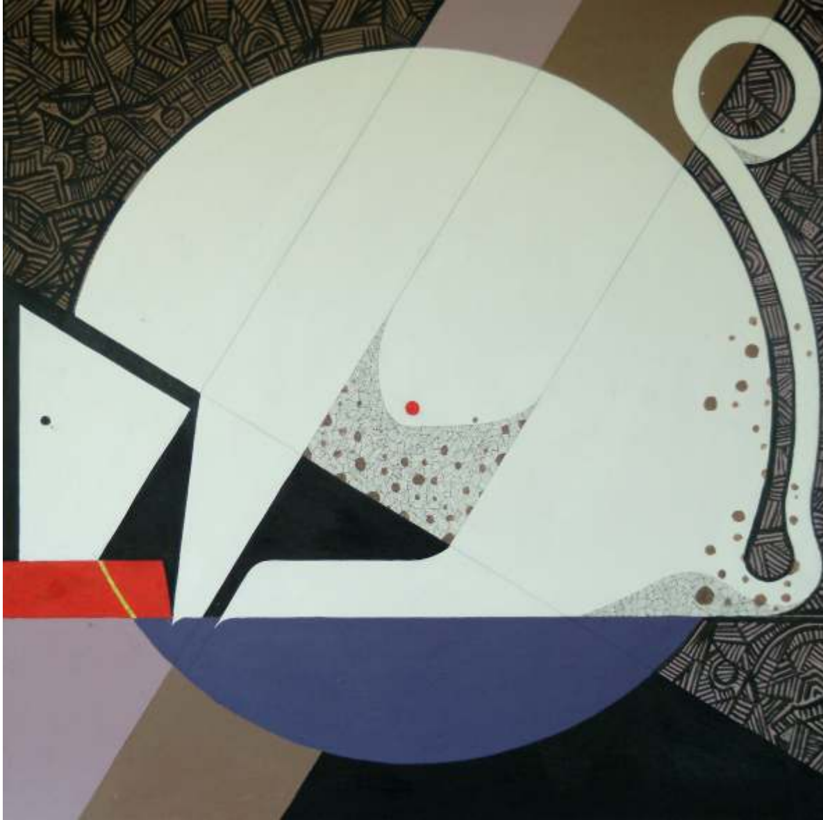
Doug Lloyd Staples, MAKAN, 2012 Acrylic canvas, 90 x 90 cm