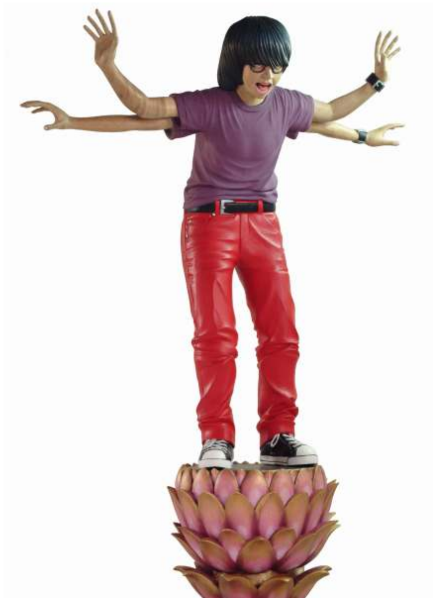
Rodney Glick, EVERYONE No.213, 2012 Carved and painted wood, 135 x 80 x 45 cm