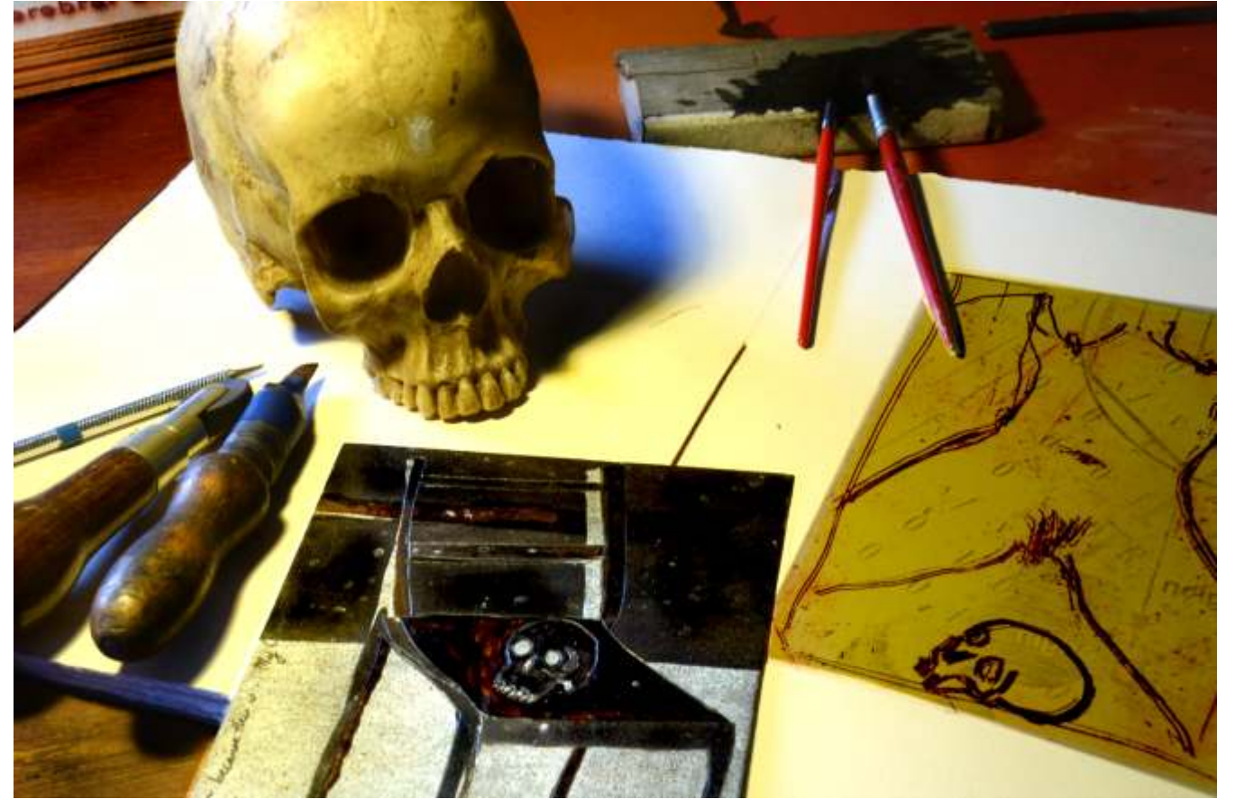
Paul Trinidad, CEREBRAL SANCTUM II SERIES, 2012 The etching plate processes in Ancient Rock Studio Byford, Australia