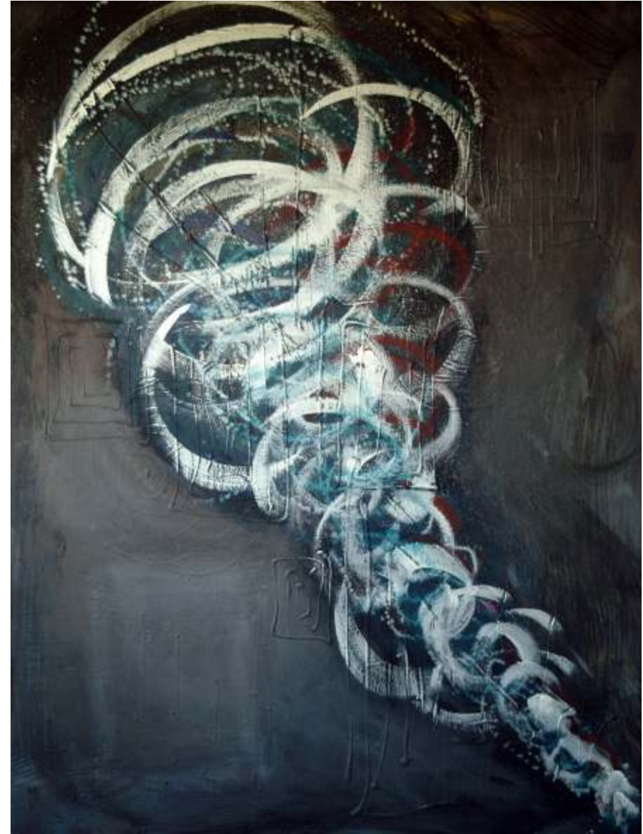
Richard Irwin Meyer, DEADLY ENERGY, 2012 Acrylic on canvas, 200 x 150 cm