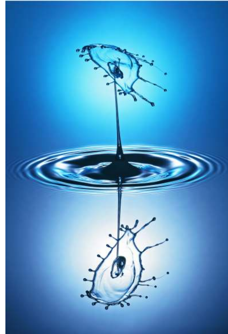
Stephan Max Reinhold, AIRBORNE, 2011 photography, giclées on canvas, 90 x 134 cm, 22 Edition Only