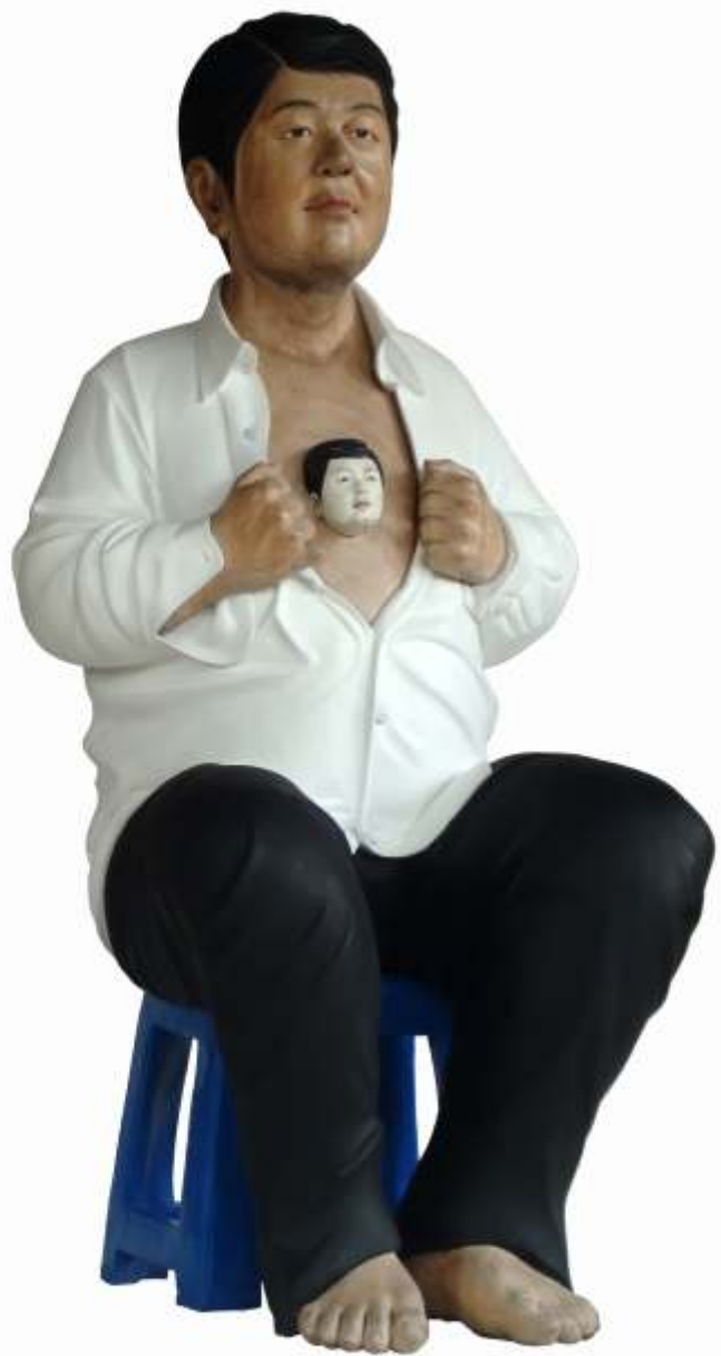
Rodney Glick, EVERYONE No.177, 2012 Carved and painted wood, 120 x 60 cm