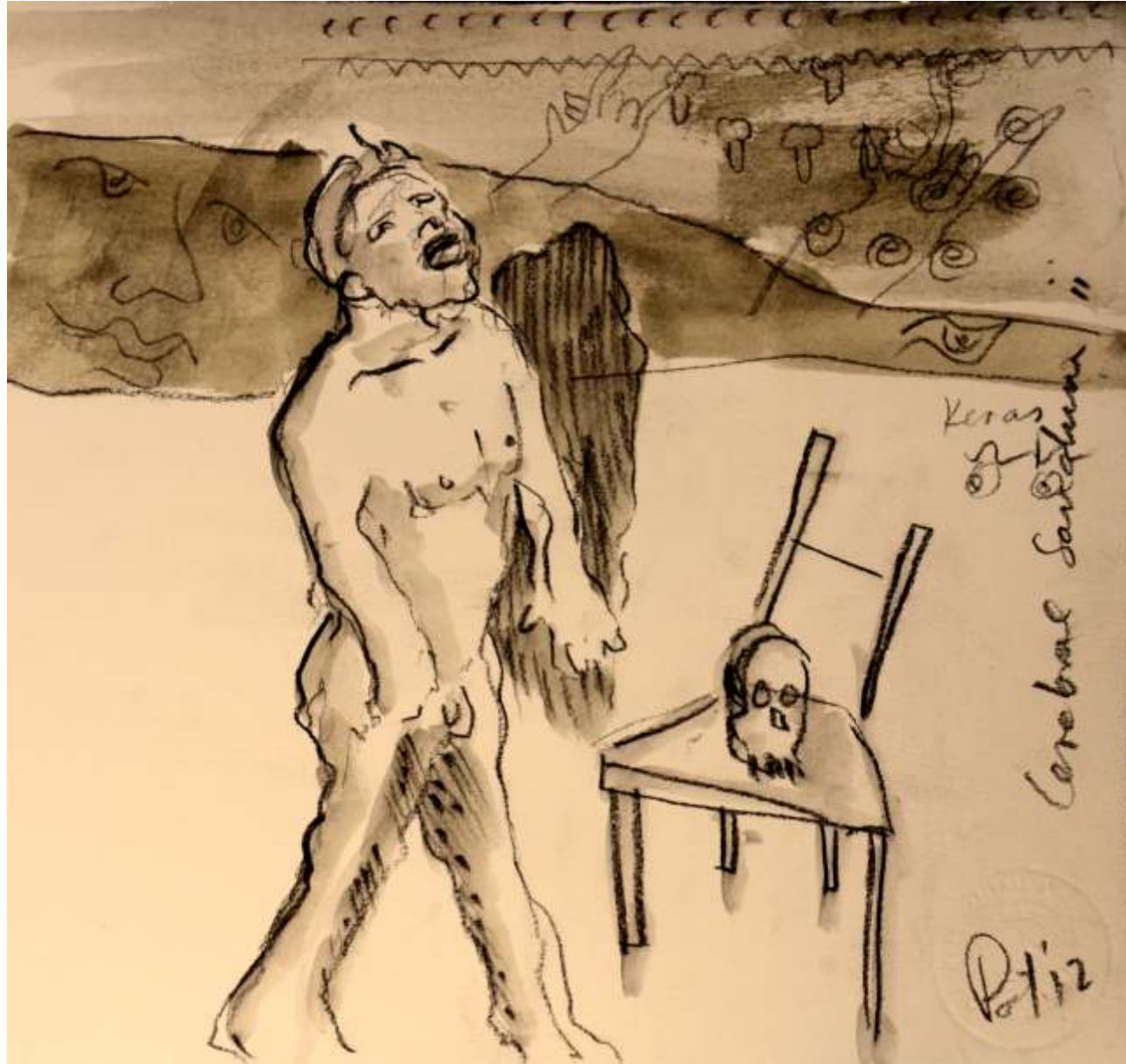
Paul Trinidad, CEREBRAL SANCTUM II SERIES - SKETCH, 2012 Charcoal on paper, 23 x 25 cm