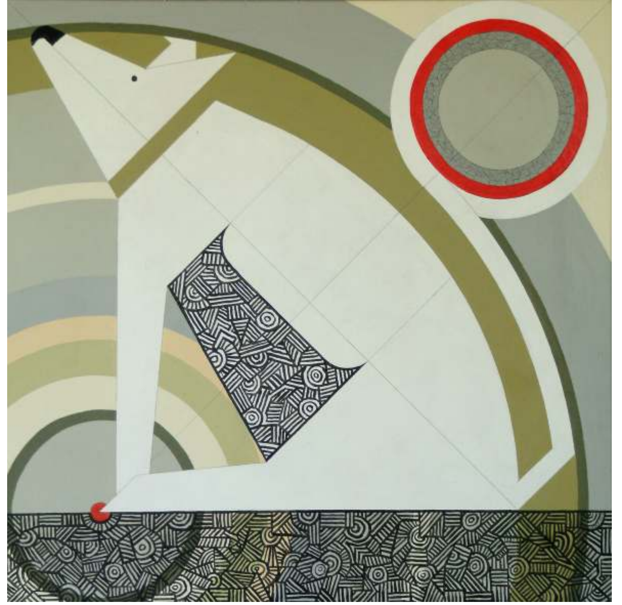
Doug Lloyd Staples, MEMANDANG LANGIT, 2012 Acrylic on canvas, 90 x 90 cm