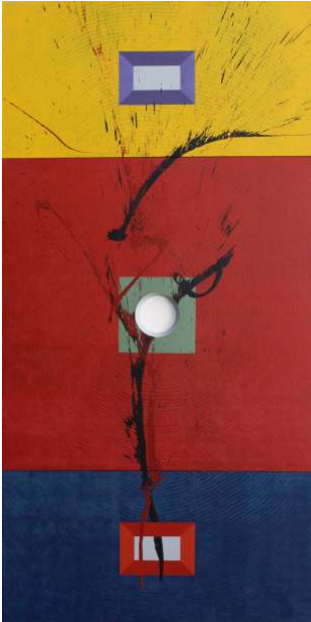
Peter Dittmar, VERTICAL TRIPTICH No.1, 2012 Acrylic & Oil on wood board, 200 x 100 cm