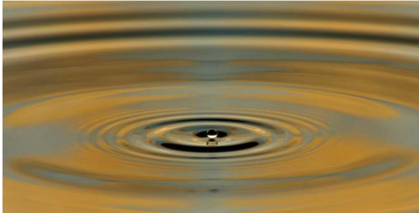
Stephan Max Reinhold, SMOOTH AS SILK, 2011 Photography, Giclées on canvas, 100 x 200 cm, 22 Edition Only